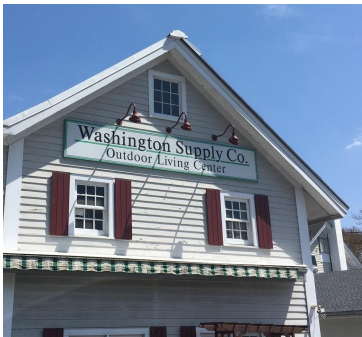
Thank you Washington Supply Co for ordering our own owl nesting boxes.

Our Own Owls - Our Own Owl nesting boxes have arrived! They are ready for delivery to everyone who has placed an order. Please contact Grace for delivery and ordering. We still have owl nesting boxes ($70) and bluebird nesting boxes ($25) available for purchase.