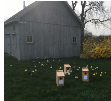
Our Own Owl nesting boxes are ready for delivery!